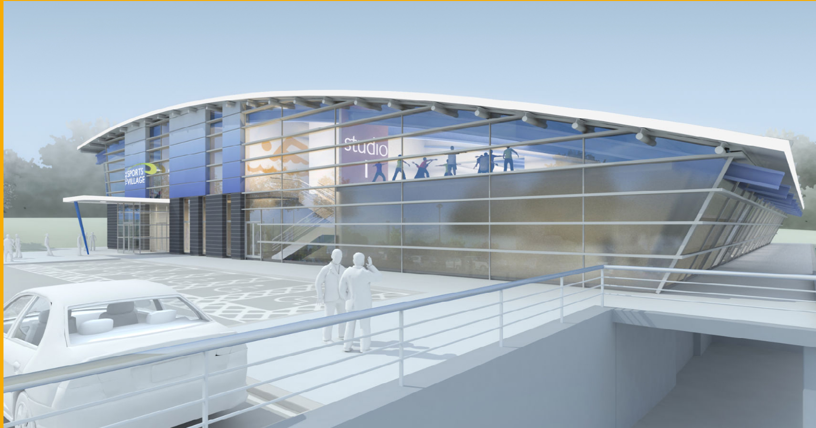
View of south west corner