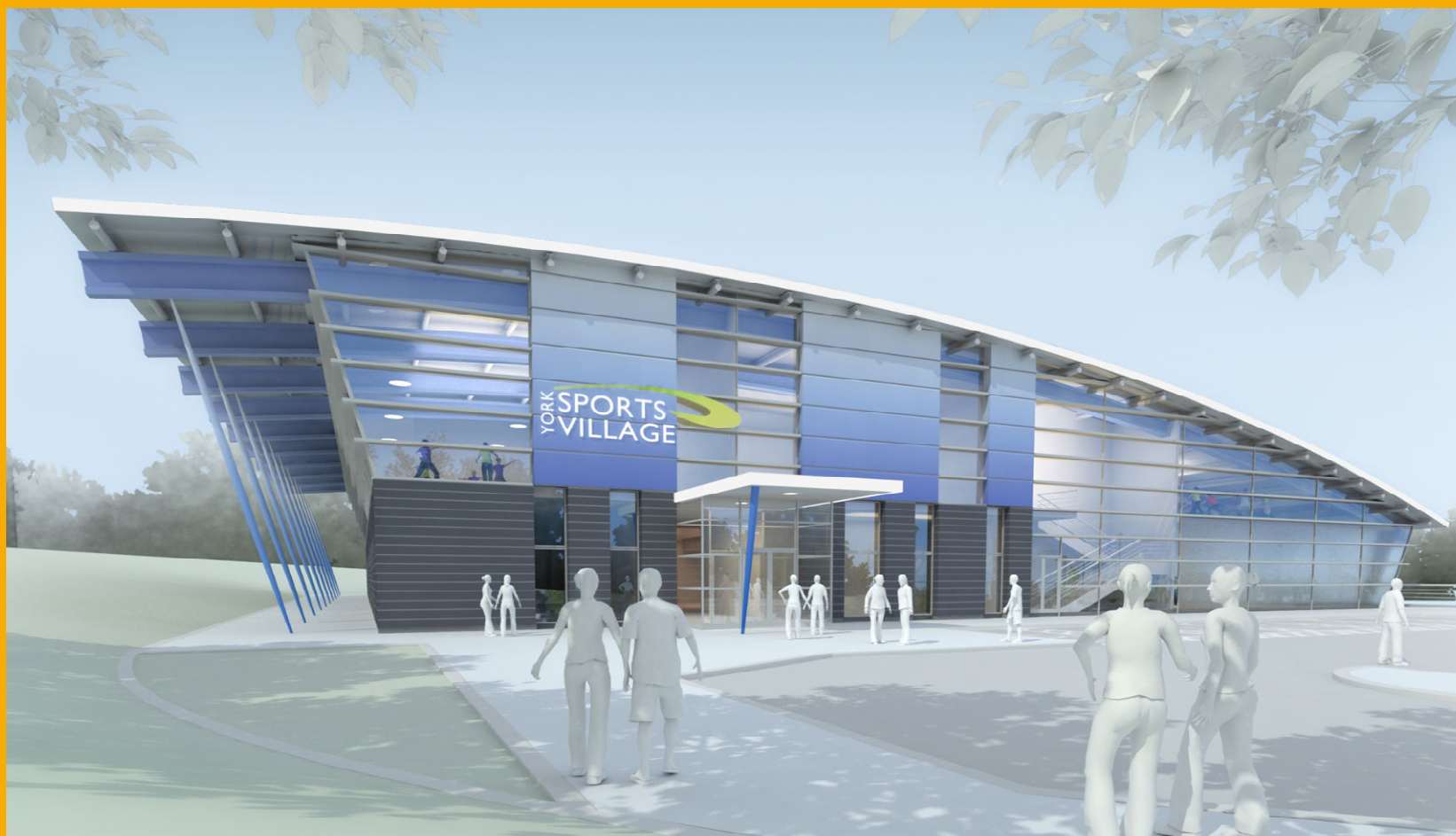
View of main entrance